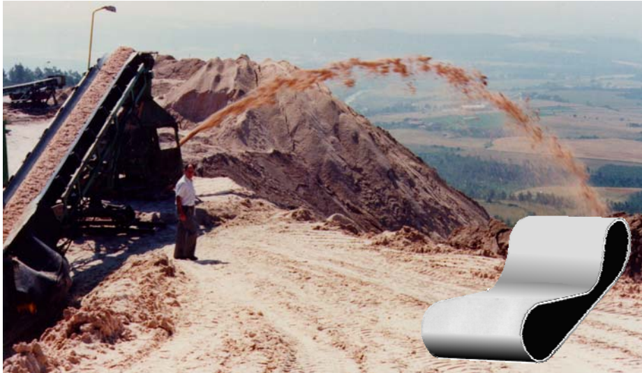
MADE TO MEASURE ENDLESS VULCANIZED BELTS